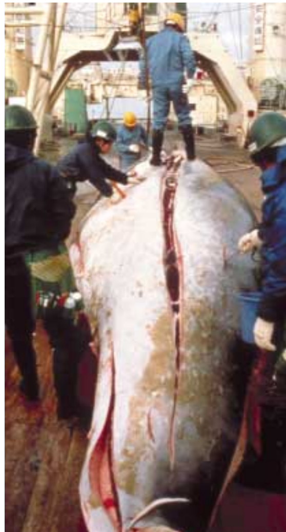
Figure 9. Tissue samples being taken from minke whale.