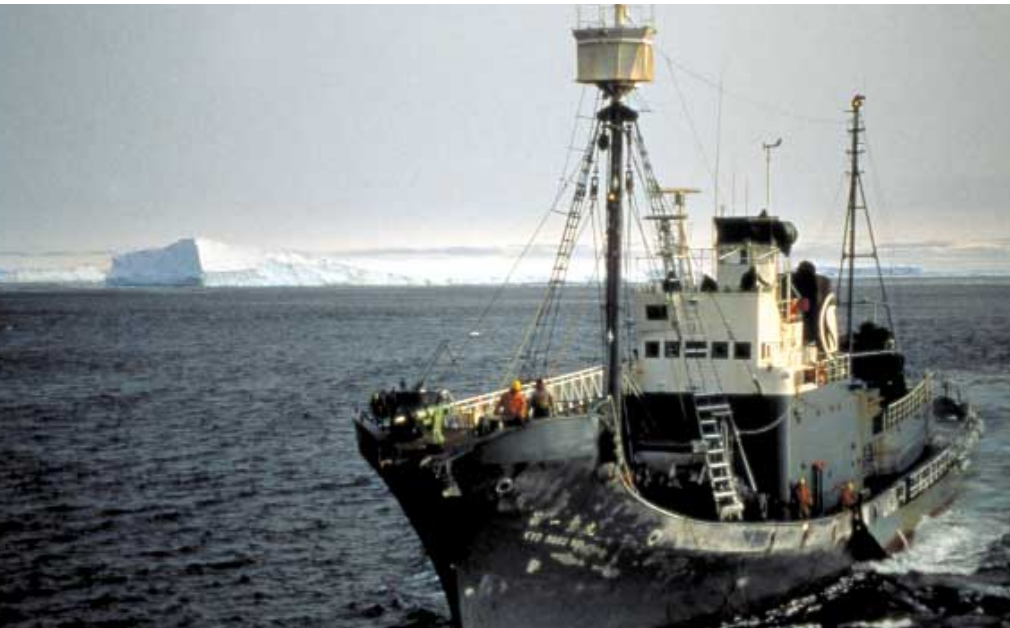
Figure 1. Catcher ship.

Taken during a Japanese whaling expedition in the Southern Ocean, Antarctica, 1993.