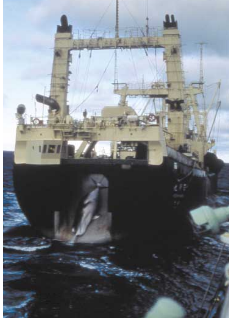
Figure 8. Minke whale being winched onto ramp of factory ship.