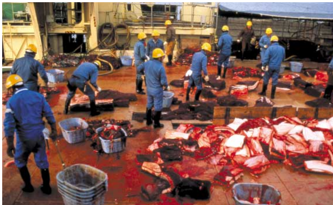
Figure 16. Whalers with large chunks of whale meat on the flensing deck.