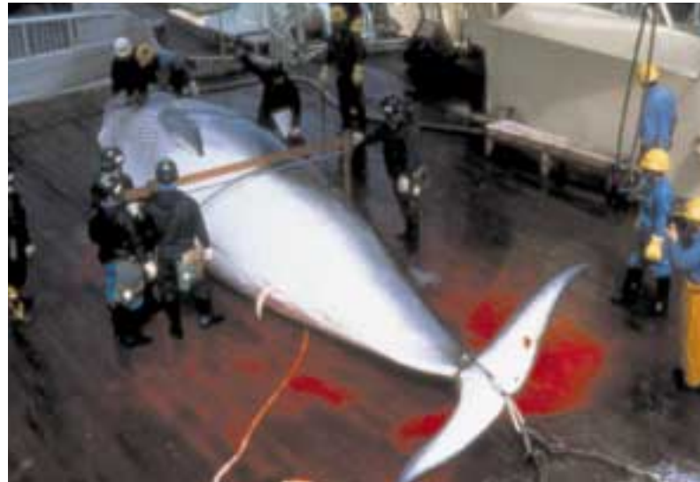
Figure 11. Minke whale being measured prior to flensing.