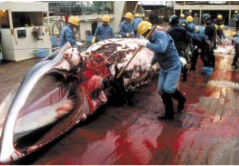
Figure 15. Minke whale being flensed on board factory ship.