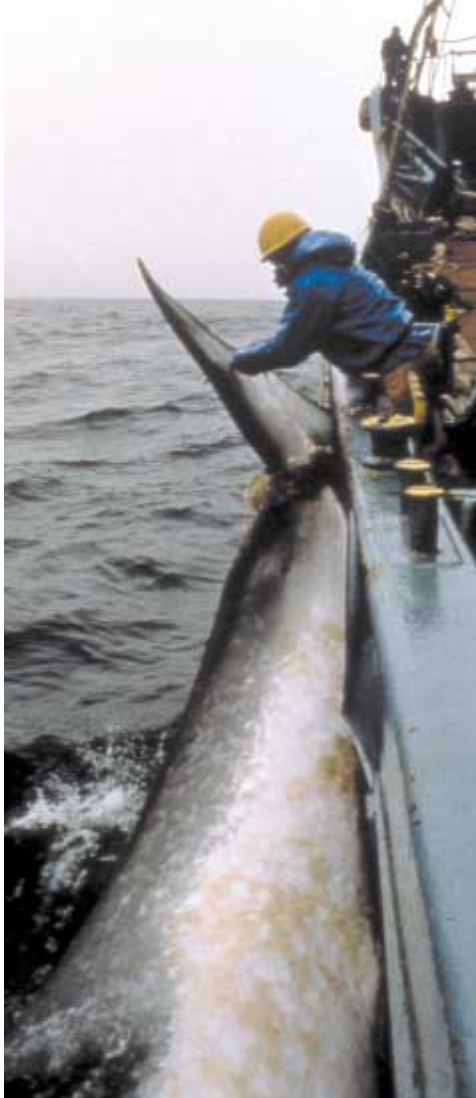
Figure 7. Minke whale being tied to the side of the catcher ship, prior to delivery to factory ship.