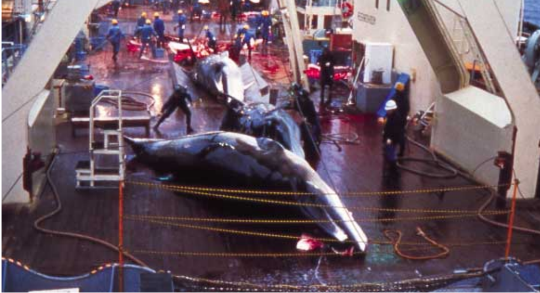
Figure 10. Minke whales on flensing deck of factory ship, showing the 'production line' aspect of special permit whaling operations.