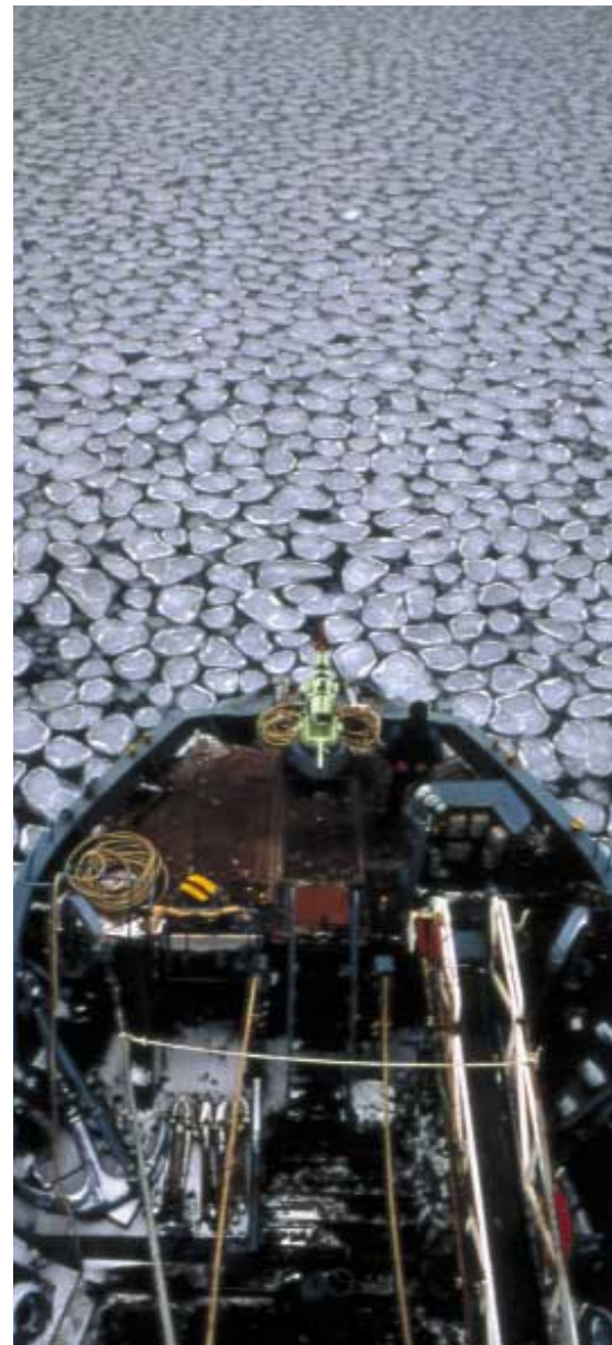
Figure 2. Sea state and weather conditions are likely to significantly impact on the efficiency of whale killing. Here, the sea surface is starting to freeze as 'pancake ice'.

Figure 3. This deck-mounted cannon fires a harpoon tipped with an explosive grenade.