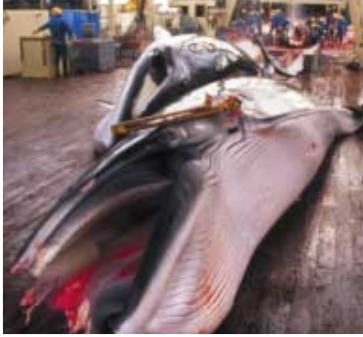
Figure 13. Processing minke whales on the flensing deck of factory ship.