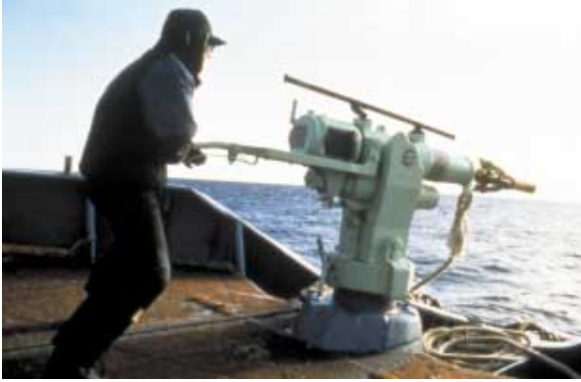
Figure 4 Whaler taking aim on board catcher ship.