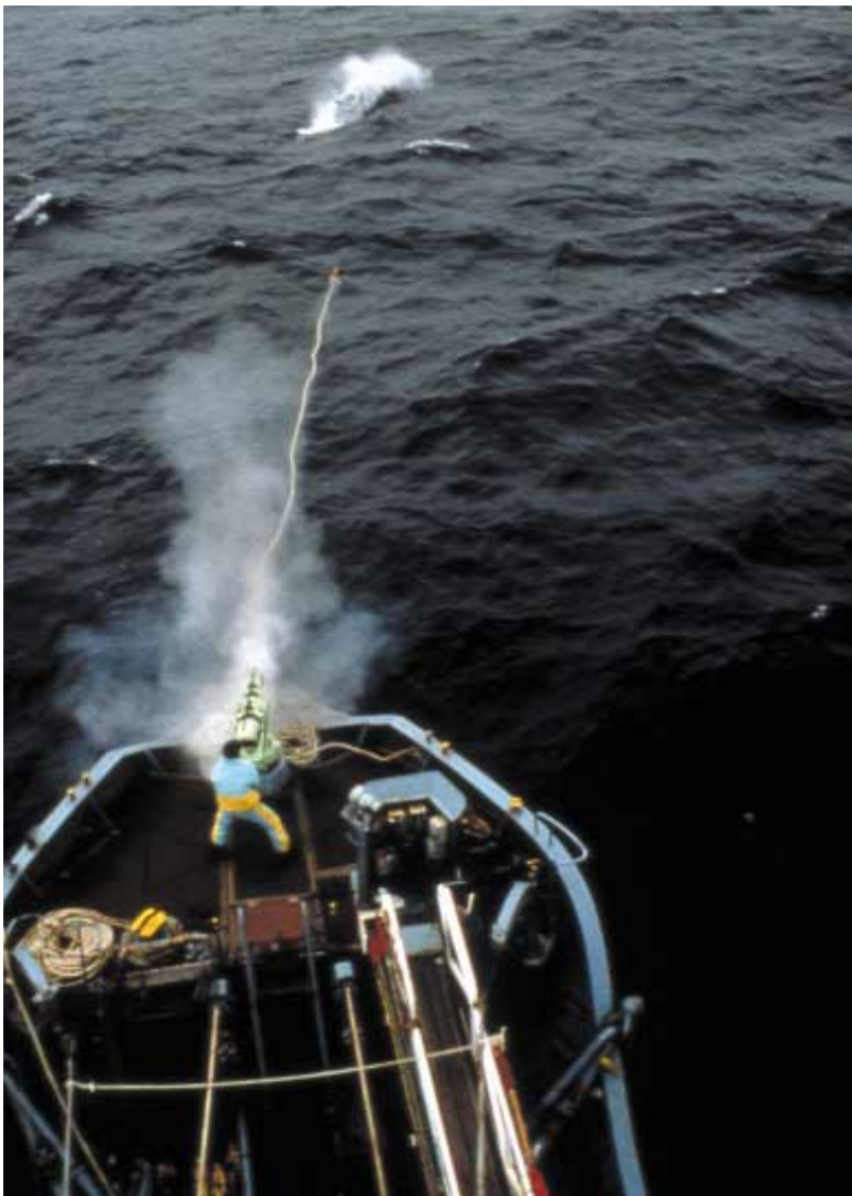
Figure 6. Harpoon in flight towards minke whale.