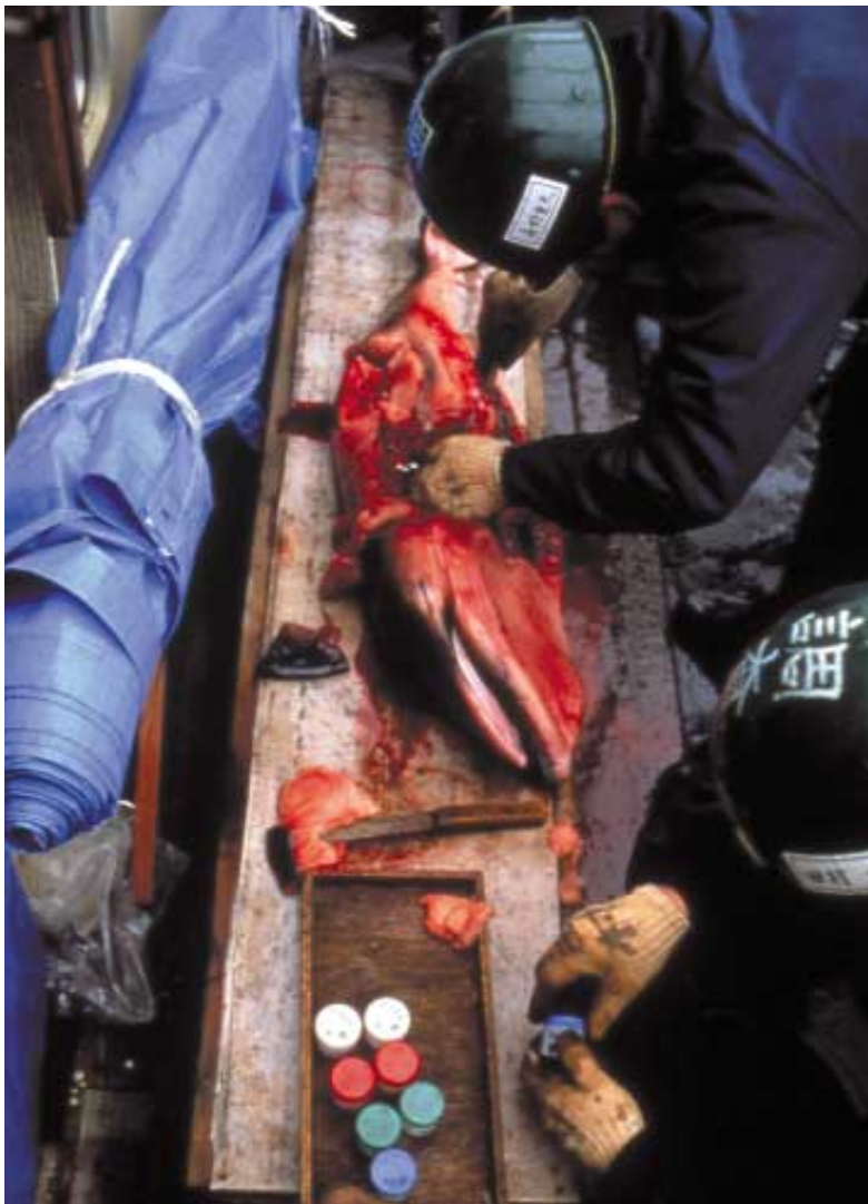
Figure 12. Measuring minke whale fetus (special permit whaling does not select out pregnant or lactating females).