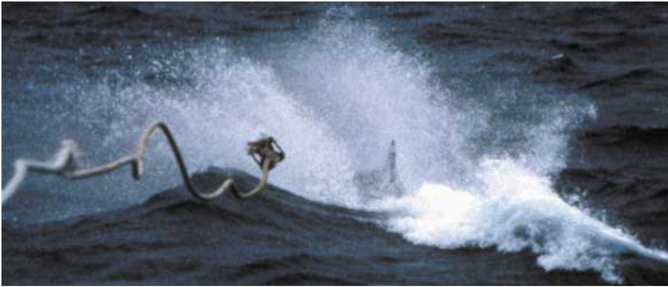
Figure 5. Since the dorsal fin of this minke whale is clearly visible, it is likely that the harpoon would strike the last third of the whale's body, some distance from the vital organs.