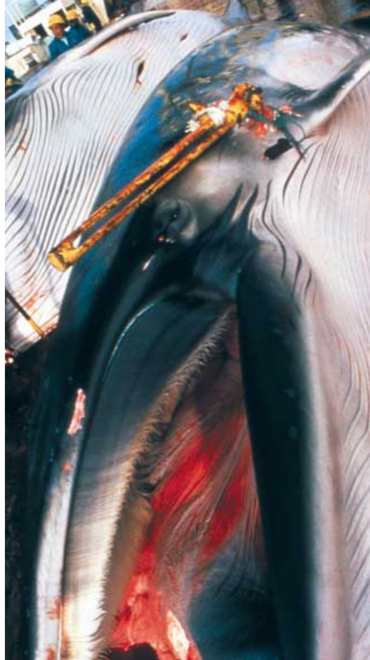
Figure 14. Close-up of figure 13.